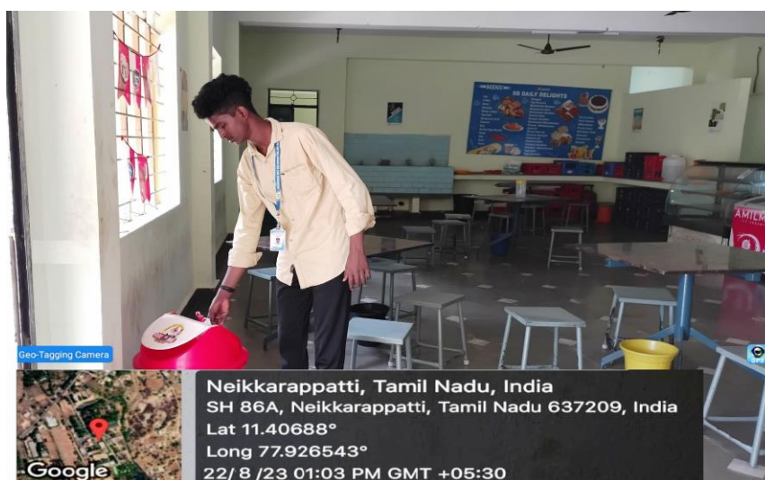
Student kept waste things in Dustbin