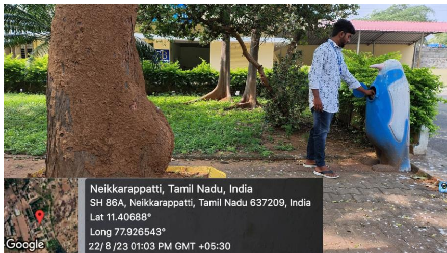
Student put dusts in dustbin