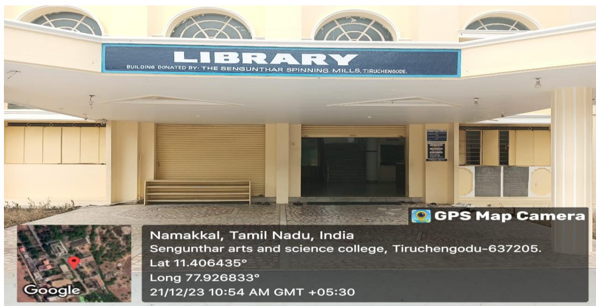
Outside View of Library

Signature 21/12/2023 PRINCIPAL SENGUNTHAR ARTS AND SCIENCE COLLEGE TIRUCHENGODE - 637 205.