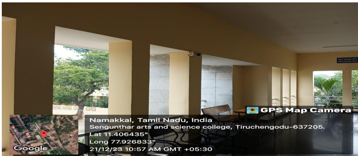
View with CCTV in Office