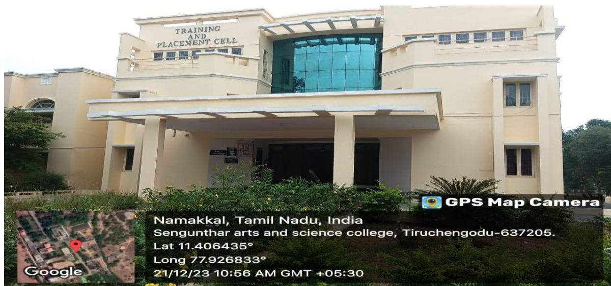
Outside View of Training and Placement Cell