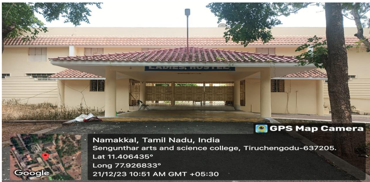
Front view of Ladies hostel with CCTV