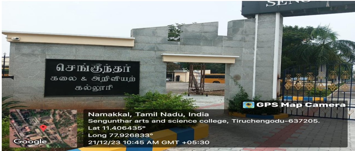
Entrance view with CCTV