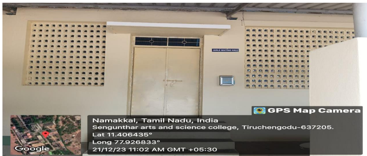
Inside View of Girls Waiting Hall