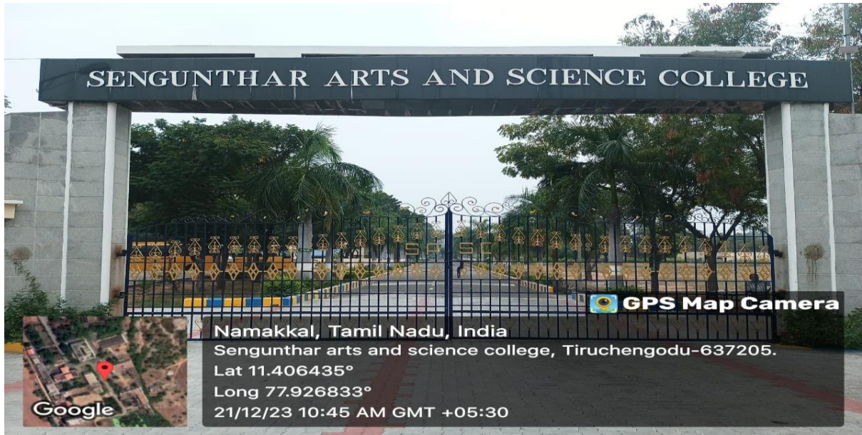
Security with CCTV at College Entrance

[Signature] 21/12/2023 PRINCIPAL SENGUNTHAR ARTS AND SCIENCE COLLEGE TIRUCHENGODE - 637 205.