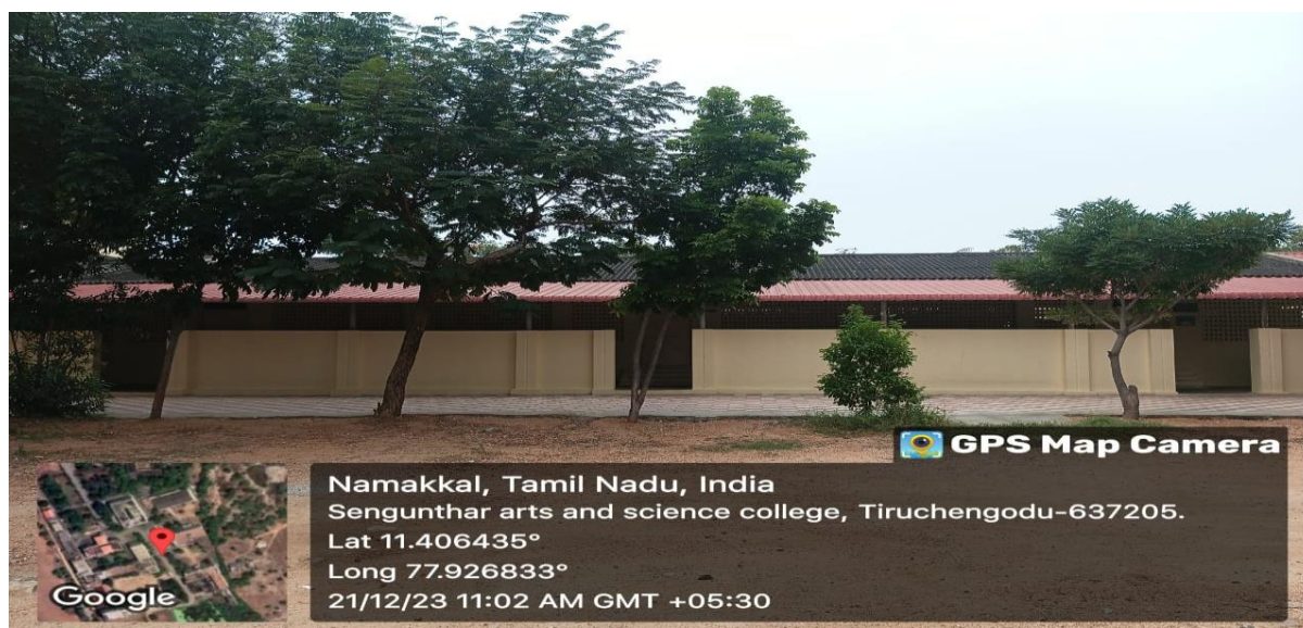
Outside View of Girls Waiting Hall

Signature 21/12/2023 PRINCIPAL SENGUNTHAR ARTS AND SCIENCE COLLEGE TIRUCHENGODE - 637 205.