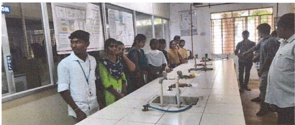
Students are explained the nutritional values of traditional food to other department students on 08-01-2021