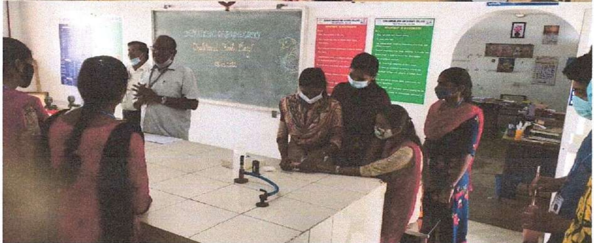
Students analysed Hb level of various department girls before traditional food taken