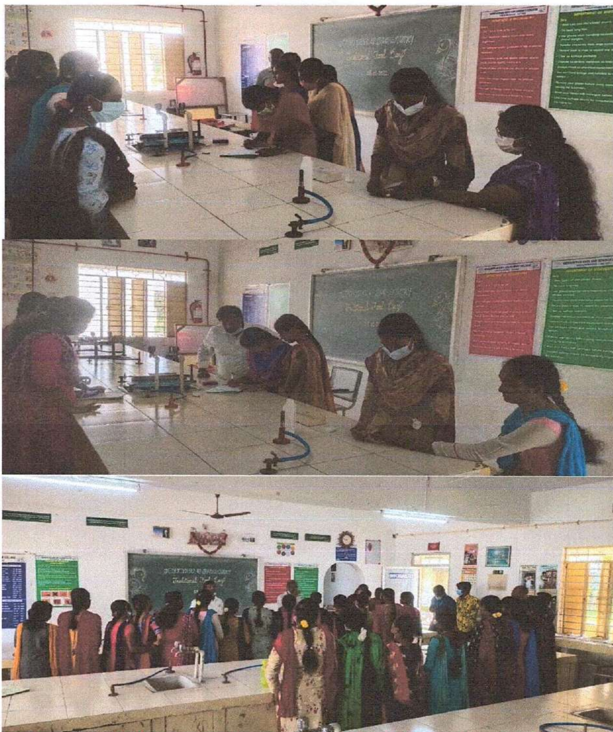
Students analysed Hb level of various department girls before traditional food taken