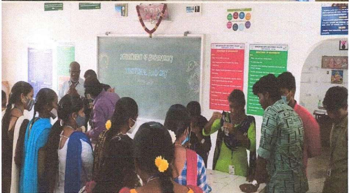
Faculty given instruction to the various department girls about Hb importance