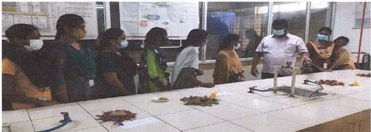
Students are explained the nutritional values of traditional foods to the principal date 08-01-2021