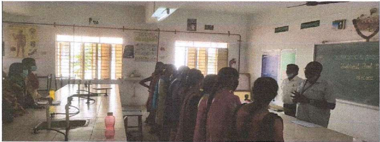
Faculty given instruction to the various department girls about Hb importance