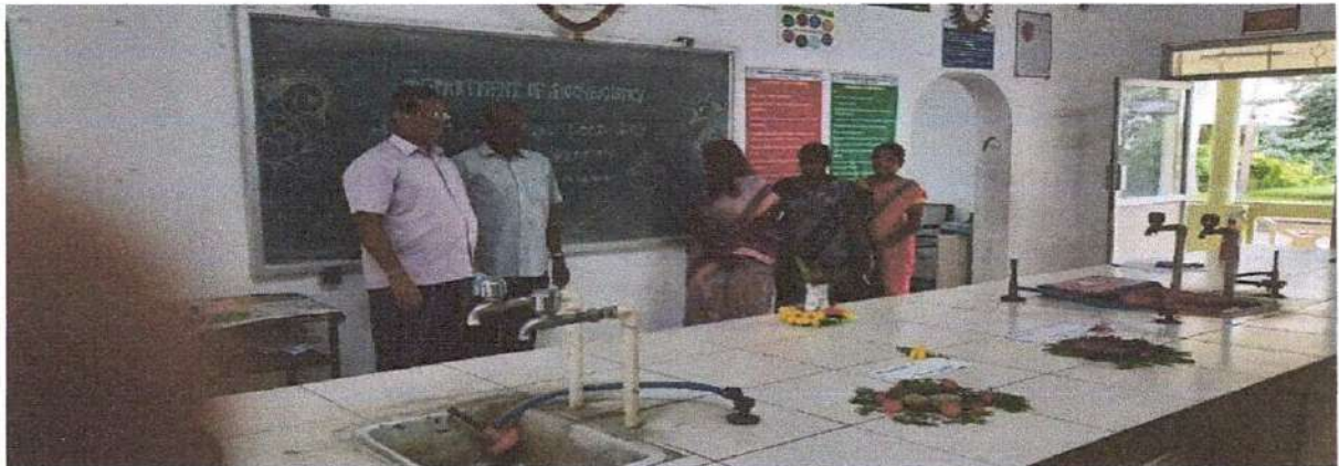
Principal inaugurating traditional food day date 08-01-2021