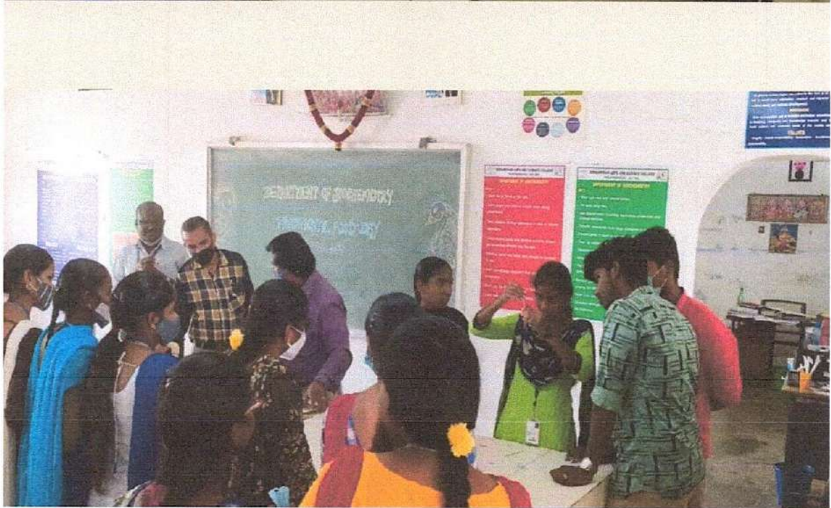
Students analysed the Hb level of various department girls after traditional food taken